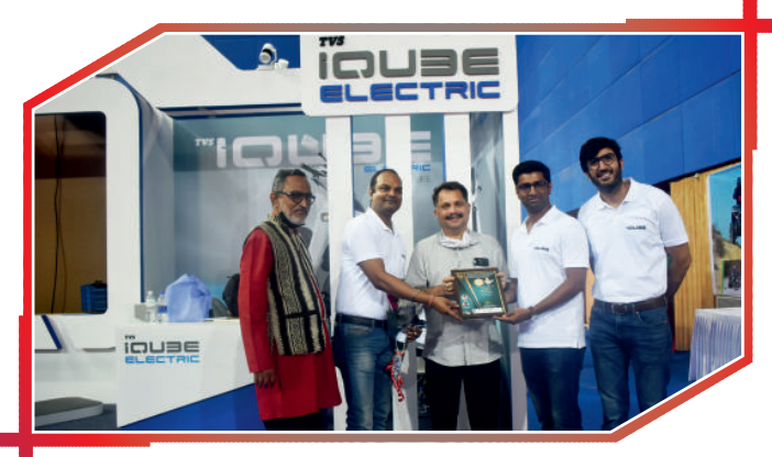
TVS Motor Company