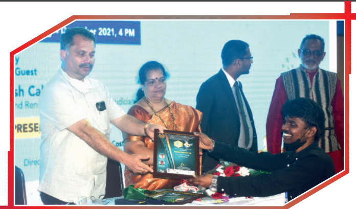
Olectra Greentech Ltd