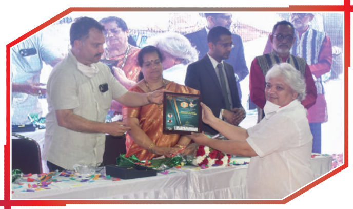
Department of Science & Technology Govt of India