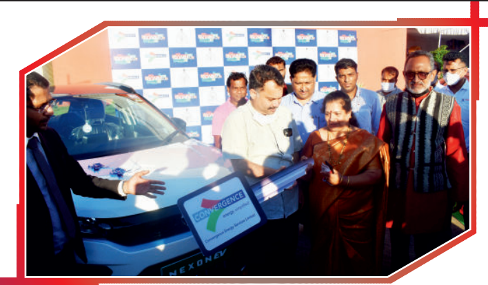
Ministry of Power, Government of India